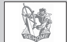
Sehome High School