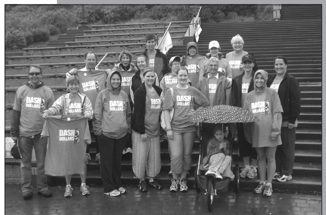
The Human Race on June 9th, 2007

A little rain could not dampen spirits during Bellingham Dollars for Scholars first year of participating in The Human Race on June 9th. Sponsored by the Whatcom Volunteer Center, local non-profits join together in this annual city-wide fund raising event. Proceeds from the walk/run enabled BDFS to cover its operating expenses for this year. Thank you to all who donated, and/or participated. We plan to make this an annual event, so lace up those walking shoes and join us!